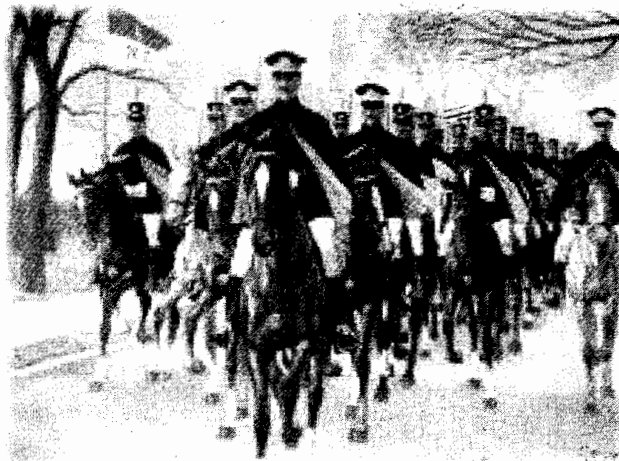
1 ST New Jersey Cavalry

MISSION STATEMENT: It is the continuing objective of The SPUR to foster and preserve the Spirit of the 117 th Cavalry Association, and to promote and enhance the friendships and camaraderie of our members, who are mutually bound by service and devotion to our country. NEXT ASSOCIATION MEETING - Fridays 1930 hours: 13 SEP 19. — 08 NOV 19